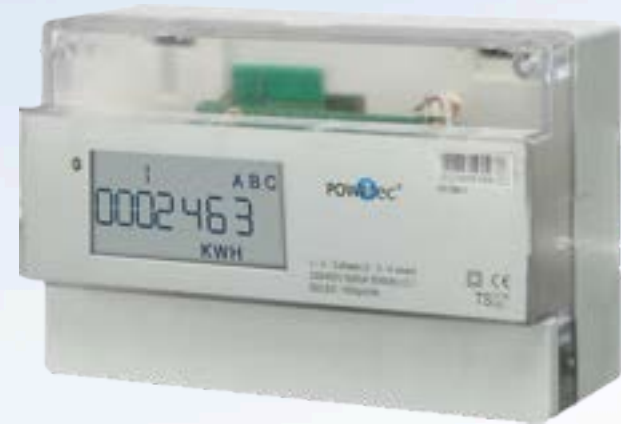
POWRtec Smart Read Meter